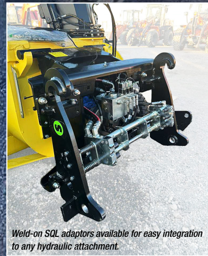
Weld-on SQL adaptors available for easy integration to any hydraulic attachment.